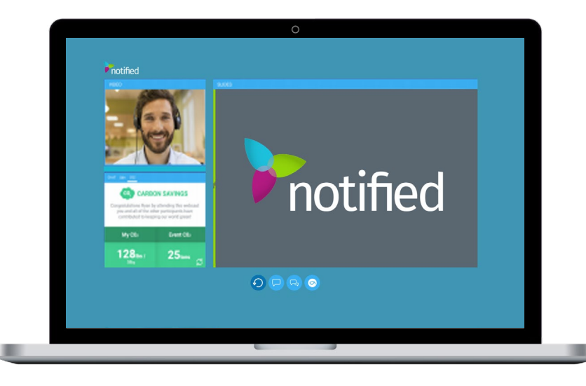
Virtual Event Savings Display